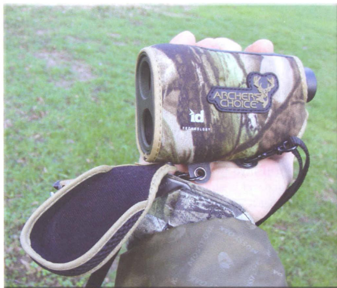
The unit is olive green in colour and weighs only 240 grammes with the battery, case and strap included.