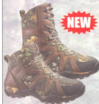
• CROWLEY HI/LOW WATERPROOF BOOT