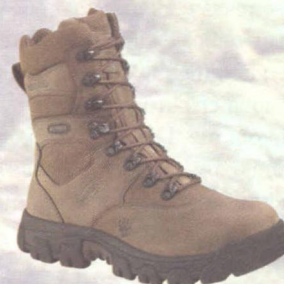
• HAWTHORNE WATERPROOF 8" BOOT