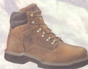
• RAIDER 6" CONTOUR WELTED BOOT

Bar Global Trading cc 011 837 2880/083 603 3833 Email : wolverinesa@polka.co.za www.wolverinesa.co.za