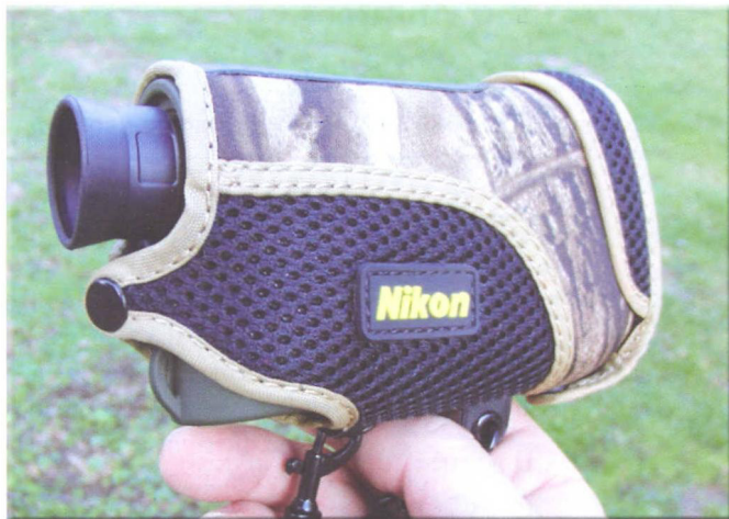
The Archer's Choice comes in a slick neoprene case that makes it suitable for one-hand use.

More information is available at http://www.nikonhunting.com .