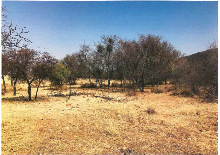
Typical rough bushveld.

The little fellow was standing as well dead still and facing to a bush opposite to him as if he is worried about something, but he did not realized us up to now. When we saw some small blades of grass moving all of a sudden also we figured out what bothered him. A small African carnivore – a mongoose – raised his head out of the grass. Funny picture, they both looked at each other before the little critter decided to walk back the way he came. “Get up slowly and ready, probably the red duiker will move forward once the mongoose is